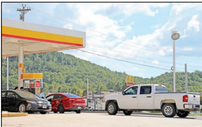
Over the past couple of weeks, when an area gas station had gas, odds are it also had lines at the pump

By Shawn Jarrard North Georgia News Staff Writer