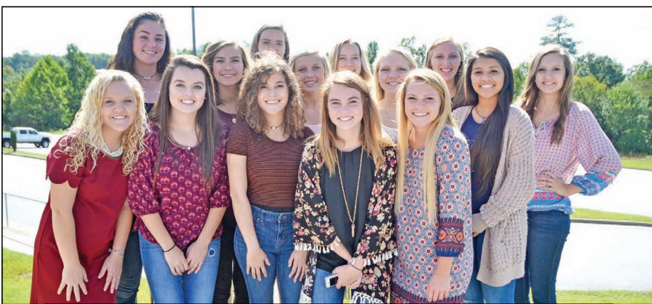
The 2016-2017 Homecoming Court