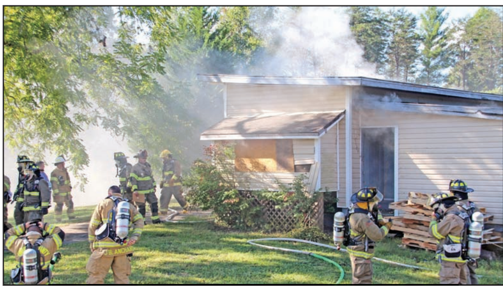
This old building in front of Station No. 12 was used for live fire training on Saturday, Sept. 24.